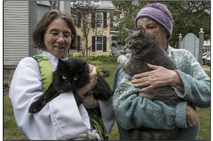
Two brave cats among many dogs—"Thundarr" at left & "Silvio" at right—get some love from their owners.