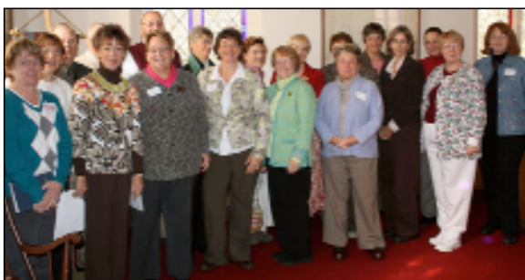
Immaculate Heart Church Choir Visits & Sings with Us