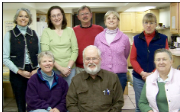
St. Luke's Vestry 2009