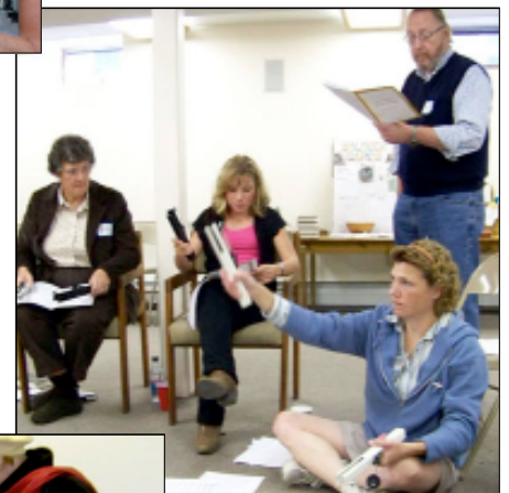
MelodyChimes being rung at Music Retreat