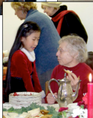
Christmas Tea & Sale spans the generations