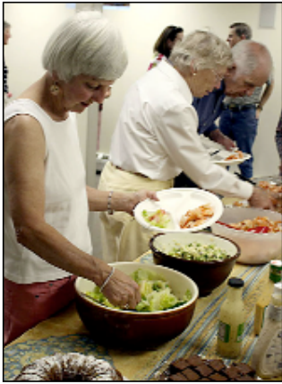
May Ascension Day Shrimp Boil