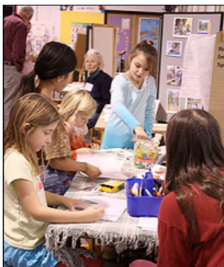
Community Outreach Day at the school