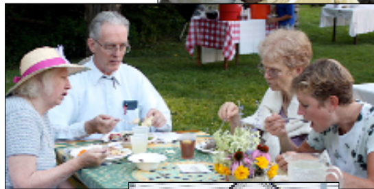
71st August Supper