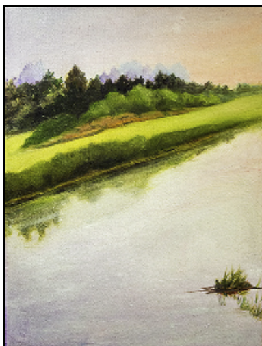
Original Oil: Vermont Landscape by Ruth Harrison