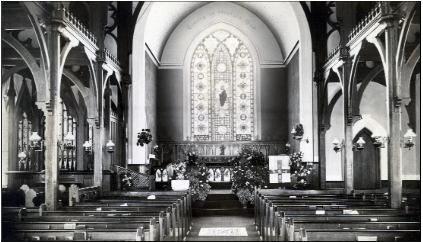
St. Luke's Episcopal Church sanctuary, Easter 1874.