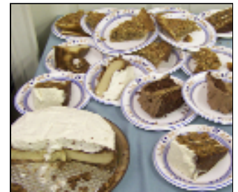
Yummy maple desserts!