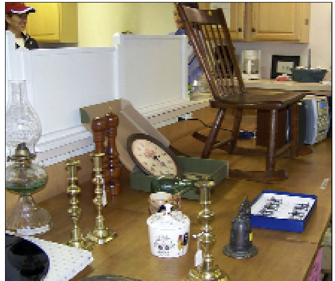
Some of the outstanding items that were offered at the Fall Tag Sale including a handsome antique child's rocker.