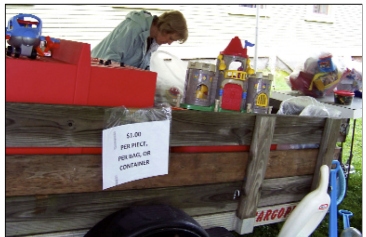
Customers found it hard to resist the offer of "$1.00 per piece, per bag or per container."