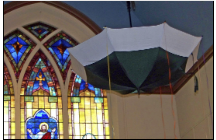
St. Luke's parishioners' blessings will soon be seen showering down onto the altar.