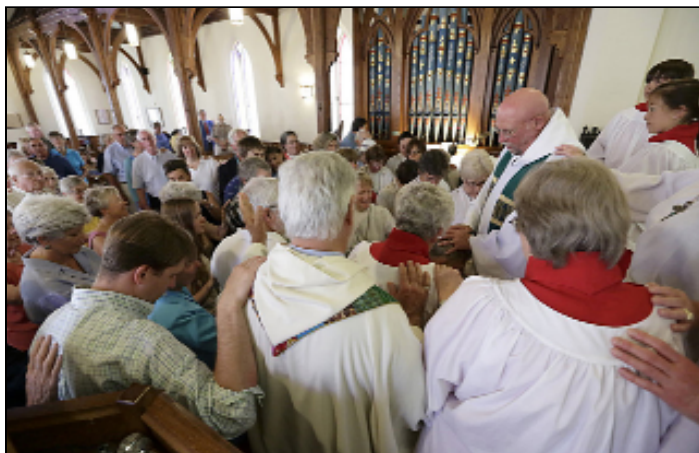
Laying On of Hands