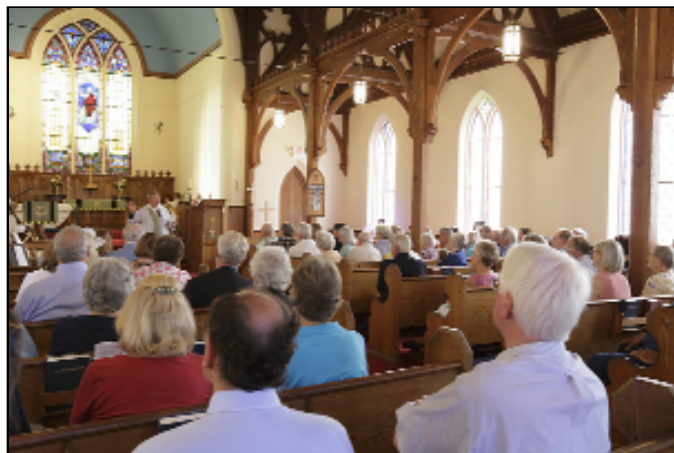
Paul's Final Sermon