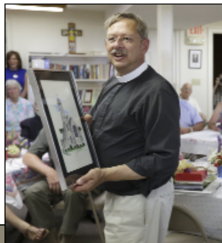
↑ Don Hofer Watercolor of St. Luke's