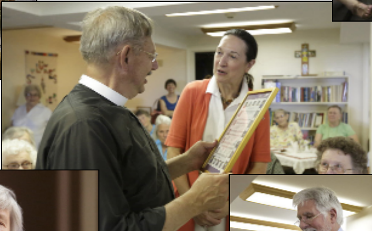
All “Farewell” photos are courtesy of Rudy Winston