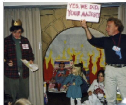
The Blazing Furnace story enacted by the church school in 1998.

Great memories to be sure. Although they do not have a specific timeline, I am delighted to share. Let's talk more about these days and build an educational empire!