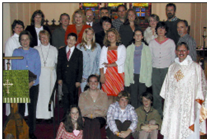
Journey to Adulthood (J2A) first ever, Rite-13 Rite celebrated on All Saints Day, November 2005 at St. Luke's.