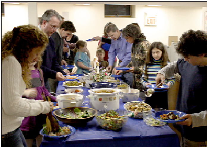
The sumptuous meal including roast lamb, goat, rosemary potatoes, salads and much more was enjoyed by a large group who gathered to celebrate the Passover Seder in Willard Hall.