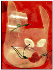
Can you guess what this is? (made from clear plastic bottles)

Many thanks to those of you who braved the snow storm and helped make bookmarks and toys on Sunday, February 8th after church. We will be scheduling another OCC workshop, hopefully in April when the weather should be nicer. Please God! In the