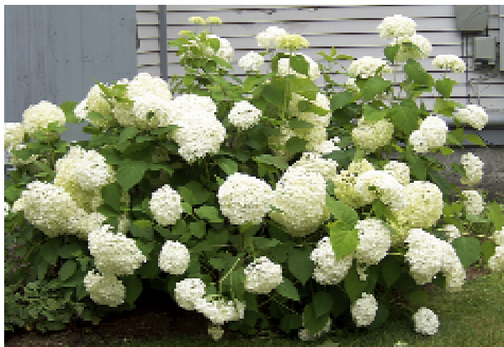
Giant white hydrangeas anchor the ends of the garden bed along the foundation of St. Luke's facing Main Street.