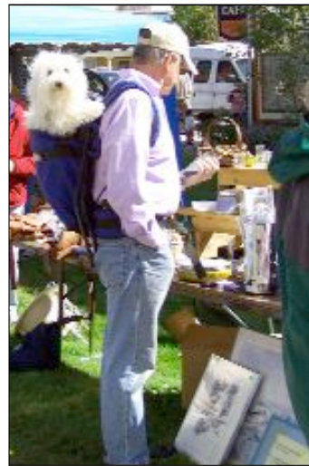
Customers came in all shapes and categories.