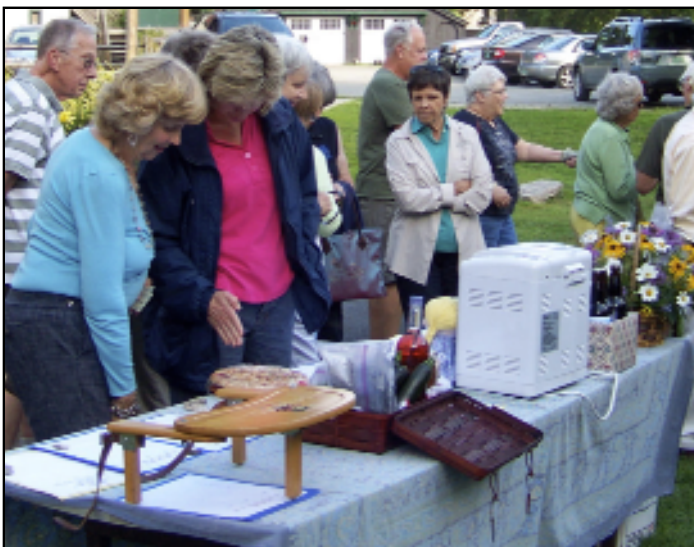
Guests check out the offerings at last year's August Supper Silent Auction.