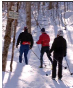
Cross-country ski (above photo) or snowshoe to raise funds for those needing heat.

Once again BROCC - Community Action in Southwestern Vermont, will be hosting Ski for Heat at Wild Wings Ski Touring Center in Peru on Sunday, January 30. You