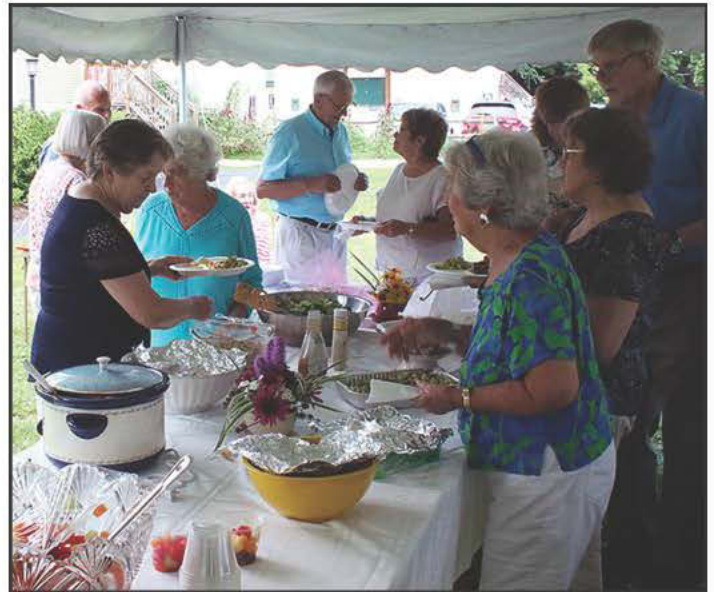
Guests at St. Luke's 80th August Supper enjoy an array of food offerings at the buffet table.