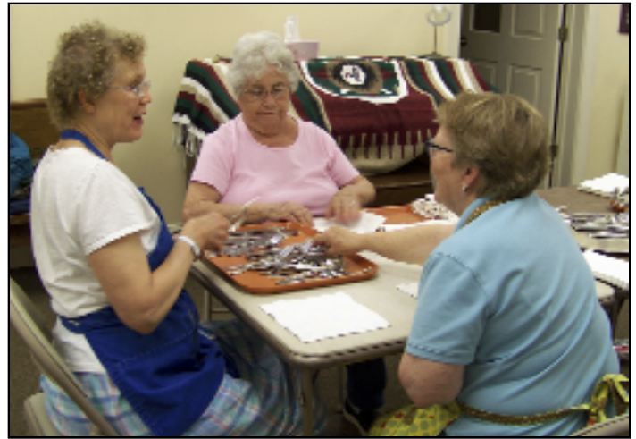
Chatting & Wrapping Silverware—a behind the scenes peek from the 2017 August Supper.