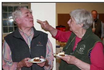
Above: Enjoying the plentiful food bounty at the Parish Picnic.