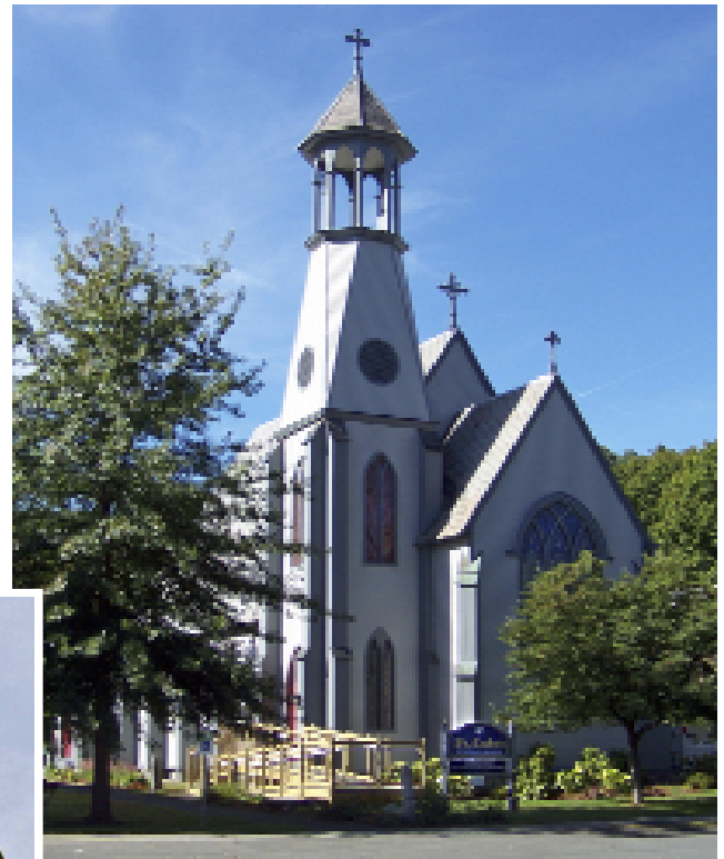
St. Luke's exterior painting is now complete.

God wants our work to be meaningful and satisfying. No matter what we do, it should provide a reason to get up each day and use the talents God has given us. As Benjamin Franklin said, "The man who achieves makes many mistakes, but he never makes the biggest mistake of all: doing nothing."