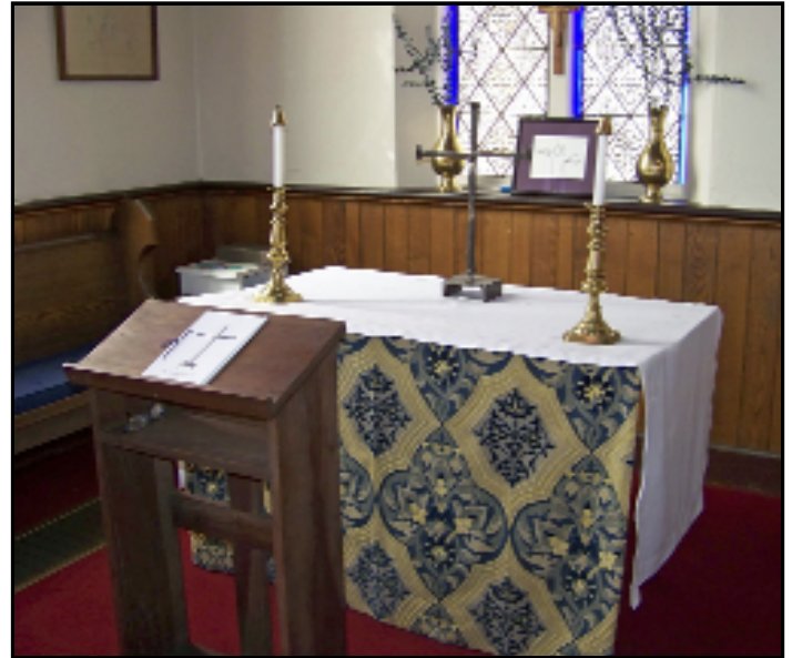
View of side chapel located at rear of St. Luke’s nave.