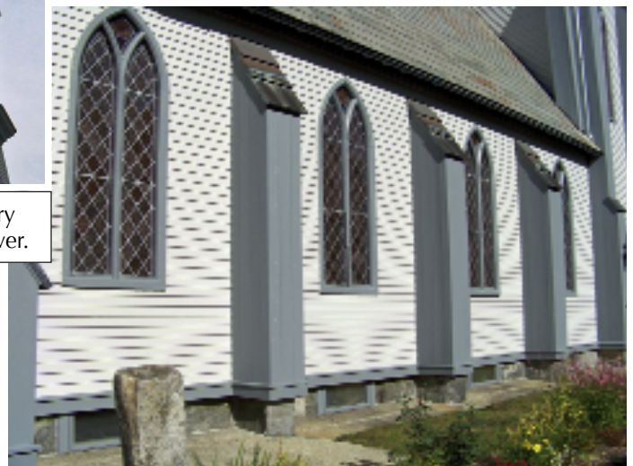
A side view of the Church with repaired skirt boards, trim and buttresses shown with their fresh coat of stain.