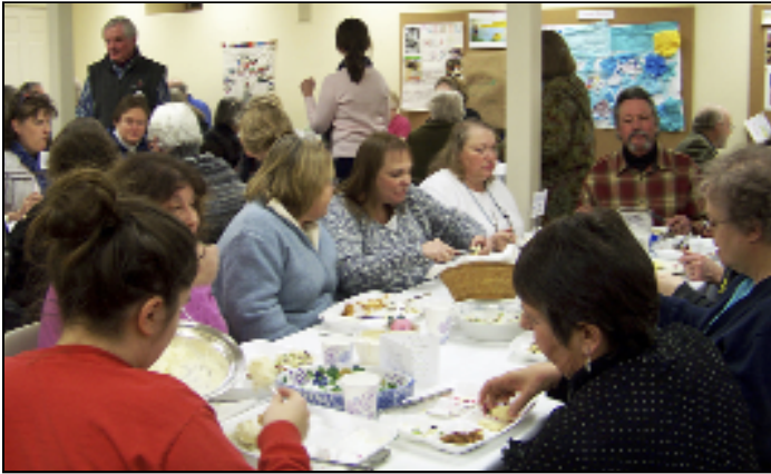
A full house enjoyed the maple enhanced dinner fare at this year's Maple Fest Fundraising Event.