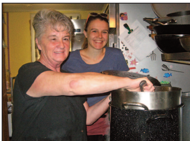
Some of the Our Place staff preparing nourishing meals.

Location: 4 Island Street, Bellows Falls, VT Phone: 1-802-463-2217. https://www.facebook.com/