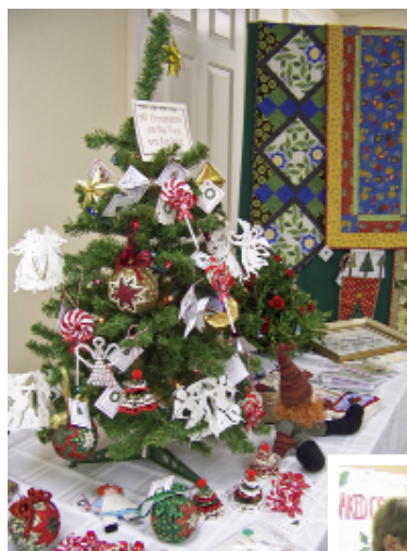
Original Handmade Ornaments & Quilted Items