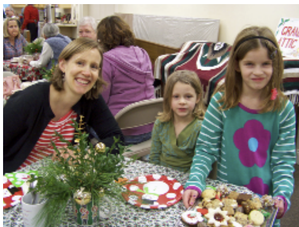
Eating & Visiting