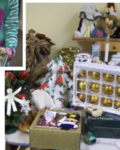
Grandma's Attic Holiday Foods for Gift Giving