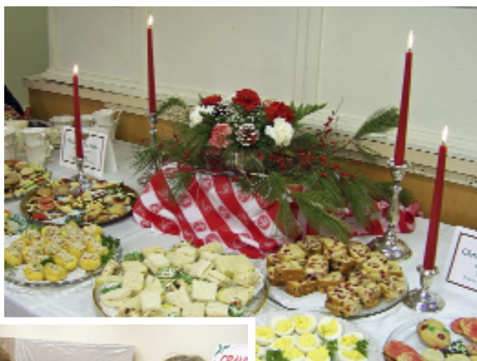
Our Sumptuous Buffet Table