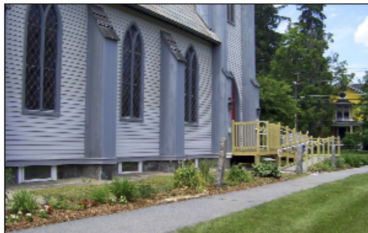
A recent view of completed walkway garden.