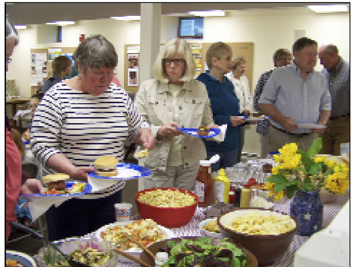
A fabulous array of salads and other side dishes to choose from the Parish Picnic buffet table